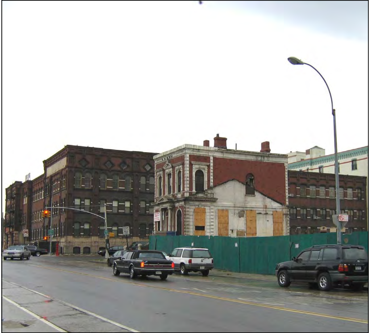
New York and Long Island Coignet Stone Company Building View from Third Street, west façade