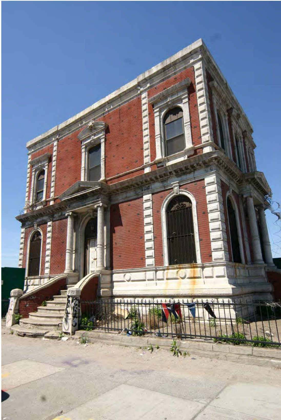
New York and Long Island Coignet Stone Company Building Third Avenue facade