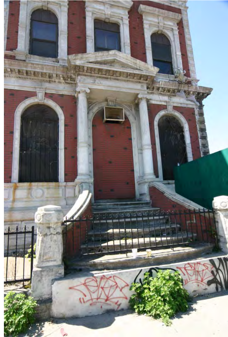
New York and Long Island Coignet Stone Company Building Third Avenue stairs and Third Street stairs