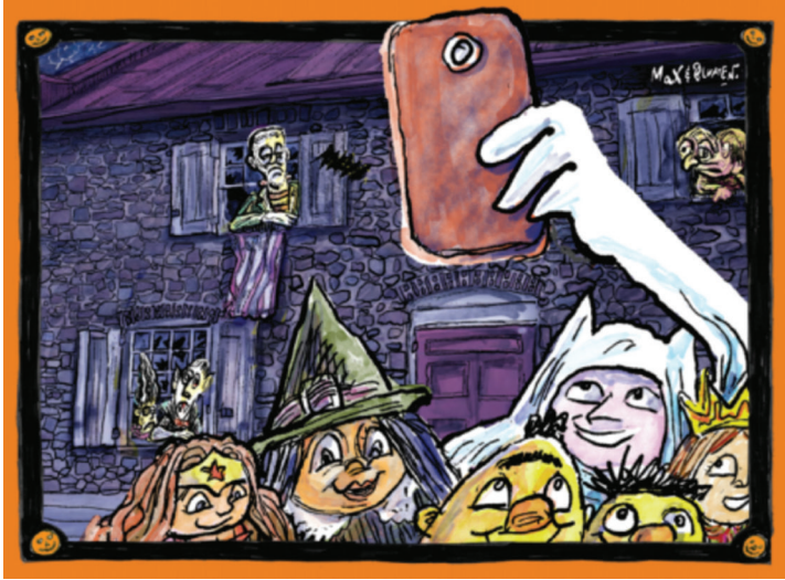
Illustration by Gerardo Blumenkranz