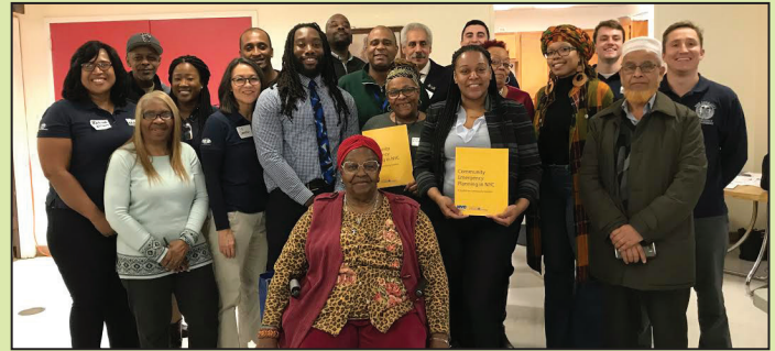
Community groups across the City (like the Canarsie Bootcamp team pictured above) have also created community-based plans to manage the response to other emergencies.

Part of developing a community emergency plan includes identifying potential vulnerabilities in your community. This year, NYC Emergency