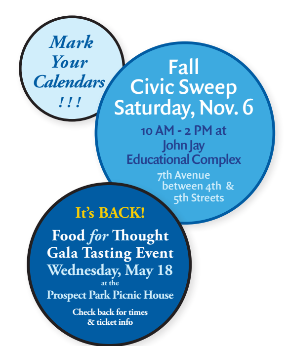
Stay tuned for details at: www.parkslopeciviccouncil.org

Box 172, 123 Seventh Avenue Brooklyn, NY 11215