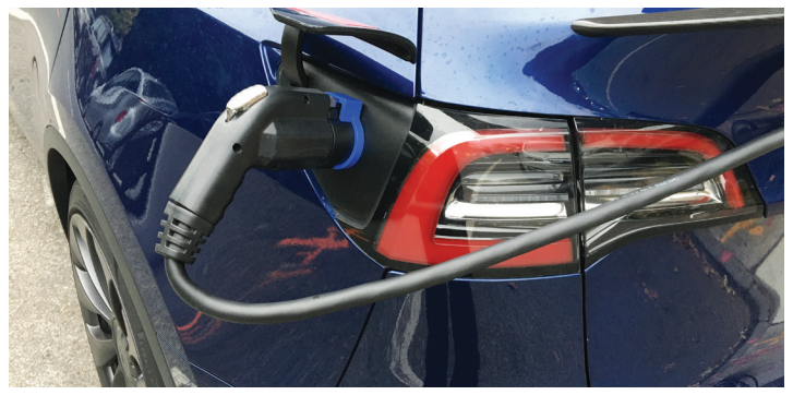
24-hour EV charging at the recently installed FLO charging station at 99 Prospect Park West, between 5th and 6th Streets

The program, which is run in partnership with Con Edison and FLO, a Canadian electric-vehicle charging company, is also installing faster, higher power "Level 3" charging stations in a limited number of city-owned parking garages around the city, but so far there are none in or near Park Slope.